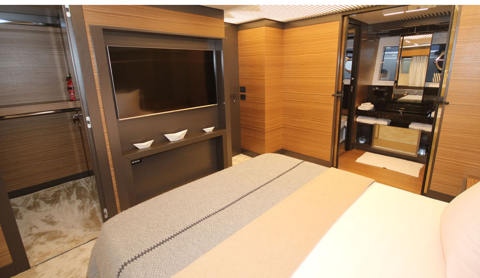
Brochure provided for information only but not for contractual purposes