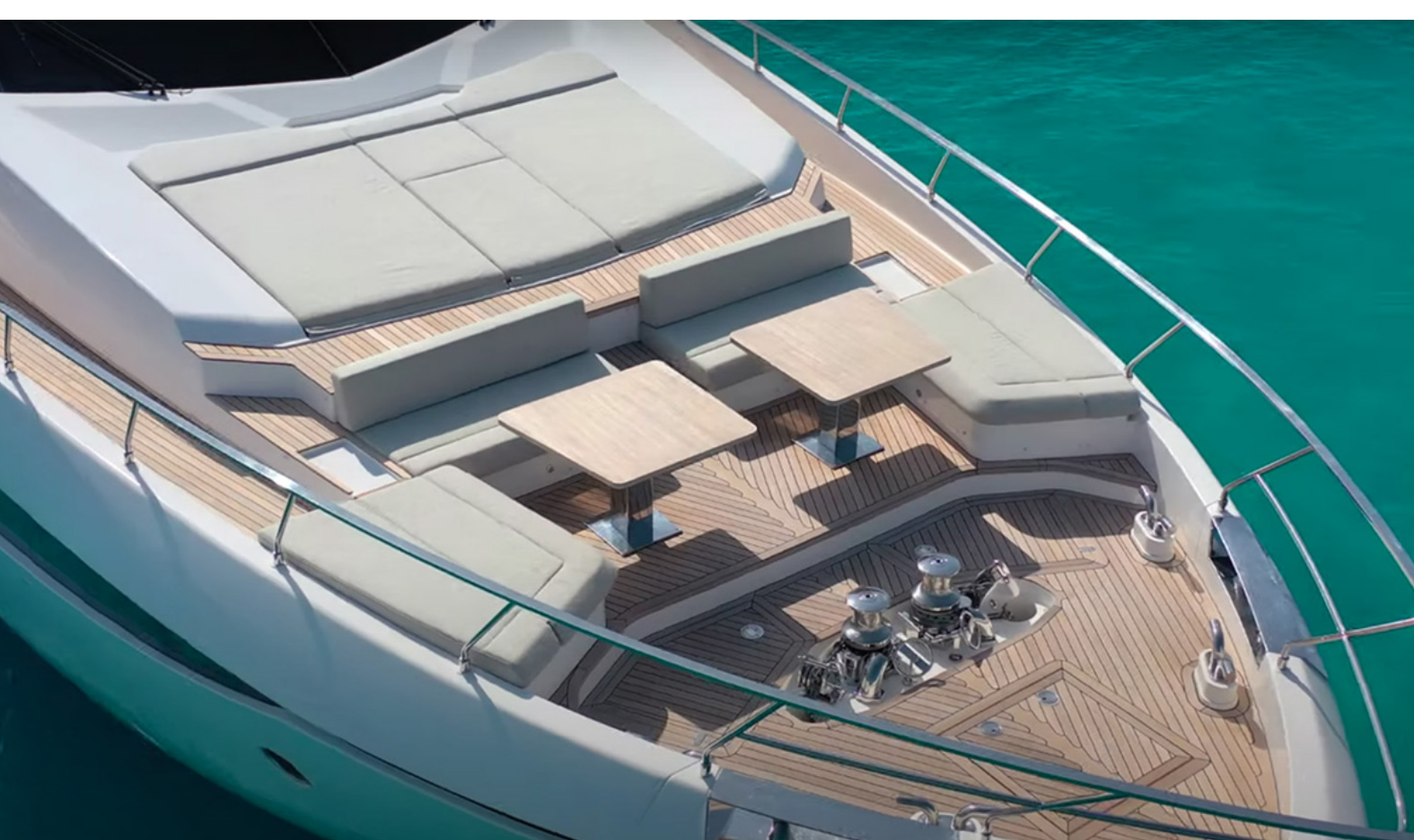
Brochure provided for information only but not for contractual purposes