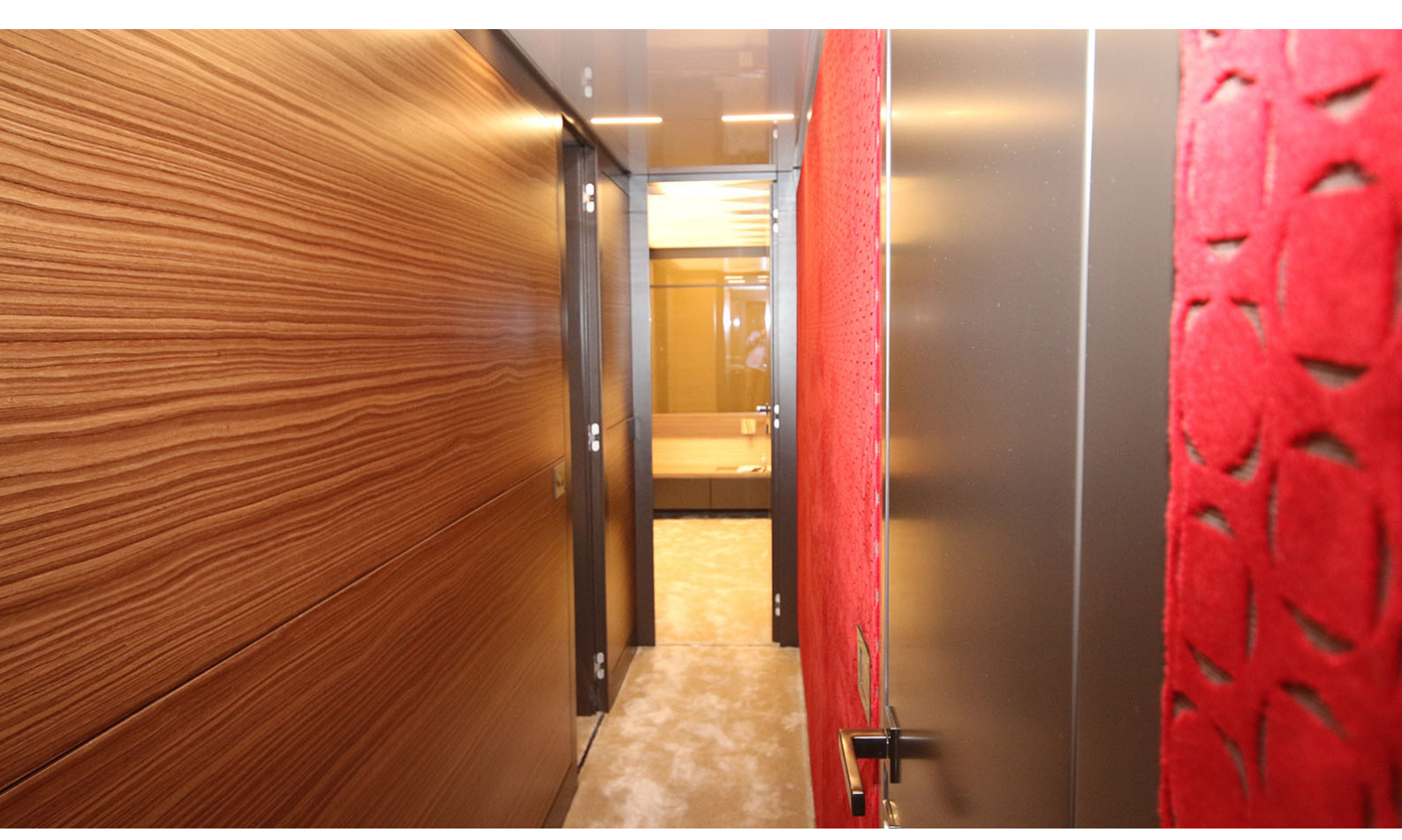
Brochure provided for information only but not for contractual purposes