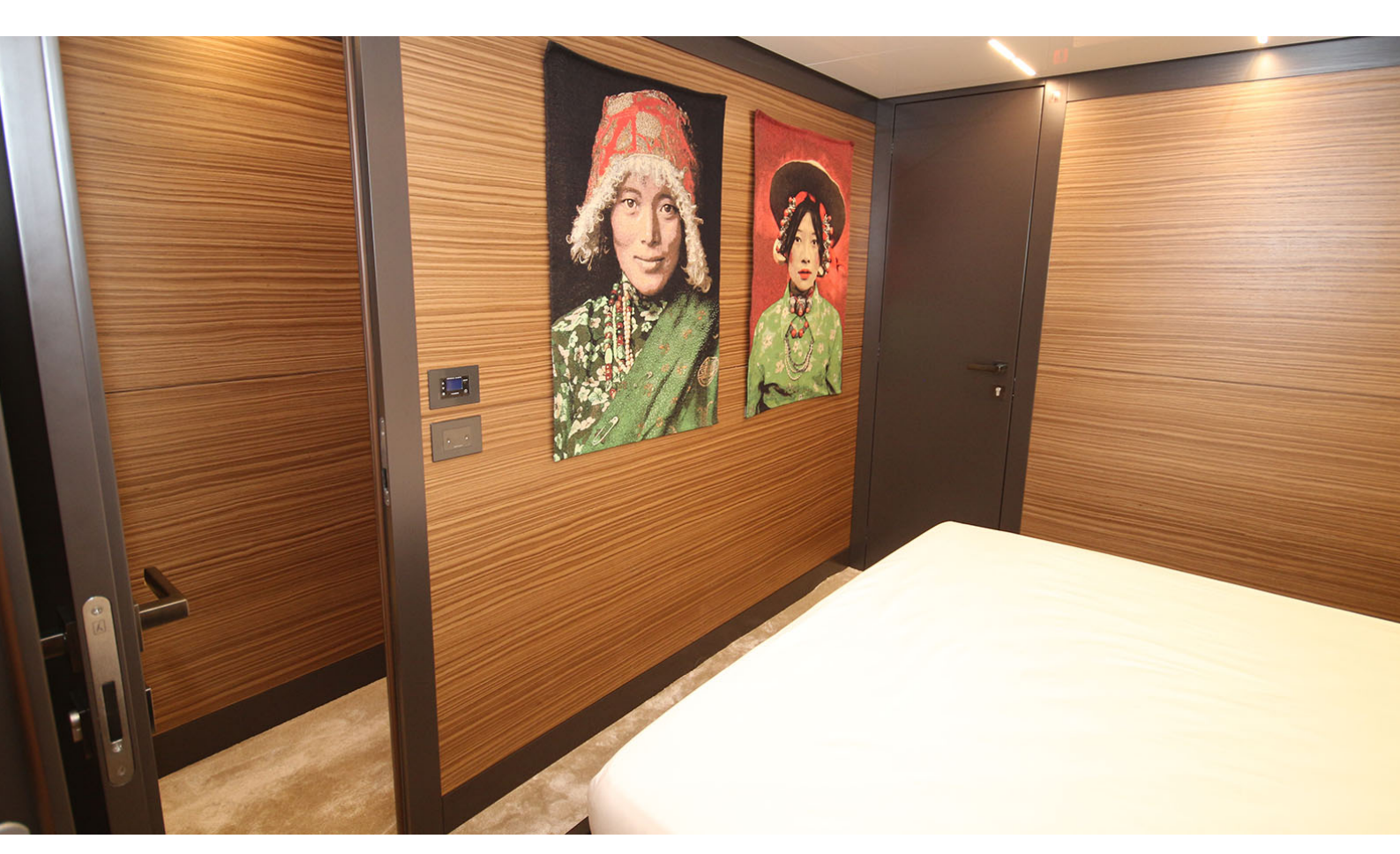
Brochure provided for information only but not for contractual purposes