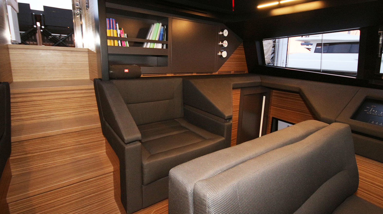
Brochure provided for information only but not for contractual purposes