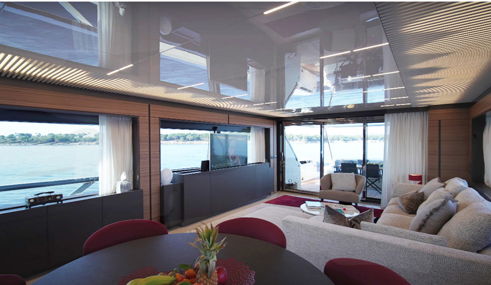
Brochure provided for information only but not for contractual purposes

NOTE: Color of seats are now beige, same model.